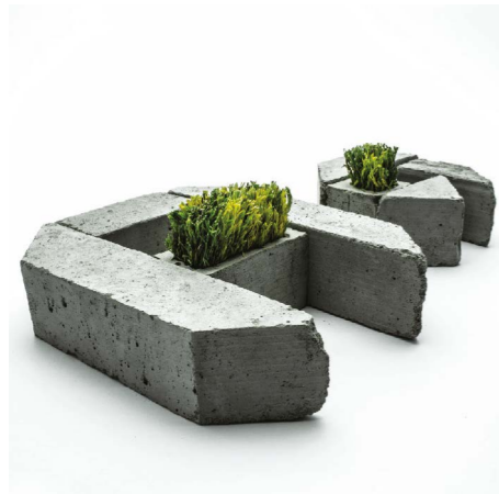
Concrete Type Typography Peter Savelli